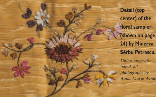
Detail (top center) of the floral sampler (shown on page 24) by Minerva Sêrbu Petrascu.

Unless otherwise noted, all photographs by Anna-Marie Winter.