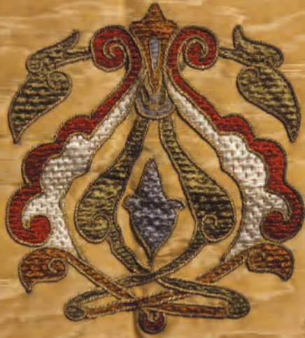
Detail (center) of the floral sampler.