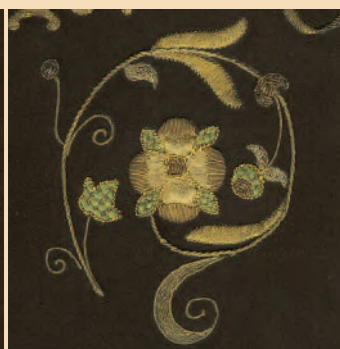
Detail (lower motif) of the metal-thread sampler.