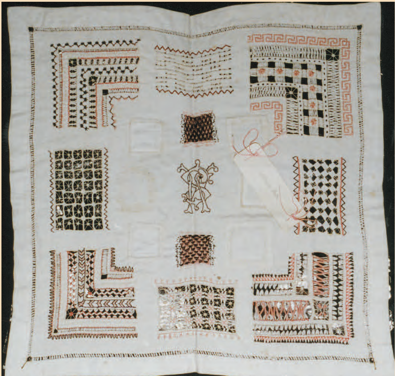
Drawn- thread and mending sampler by Minerva Sêrbu Petrascu. 14 7 / 16 x 14 7 / 16 inches (36.0 x 36.0 cm).