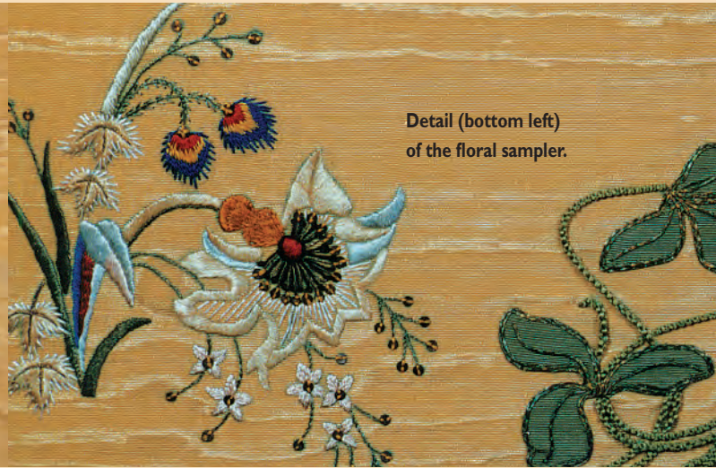
Detail (bottom left) of the floral sampler.