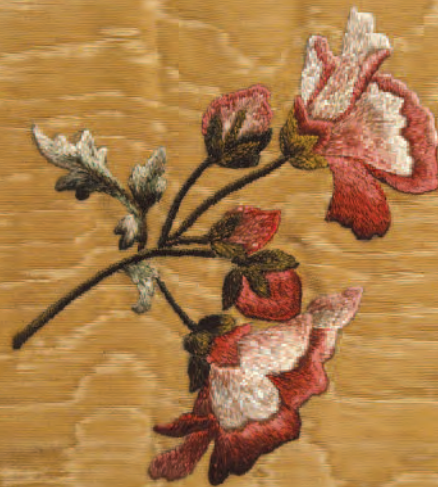
Detail (top right) of the floral sampler.