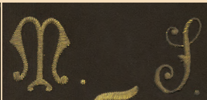
Detail (initials) of the metal-thread sampler.

purl. The rectangle is outlined in a heavy gold braid. On either side are motifs of a moon and fleur-de-lis. The moon is couched with purl over a padded card. The lower motif is floral with couched braid stem, padded leaves and flower using purl, passing thread over padding, and Artsilk. In the center of the sampler are the initials "M. S." The initial "M" is worked in passing thread over card and outlined in a fine running stitch. The "S" is worked in purl over heavy padding.